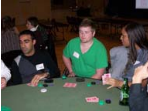
With 80 plus at Casino Night, the student population was well represented from both area universities. It has been said that students are hard to beat at Texas Hold'em! But...